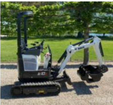
MINI EXCAVATOR 1T

DIGGING DEPTH: 1.8m WIDTH: 710 - 1,100mm ENGINE (STAGE V): 7.5kW