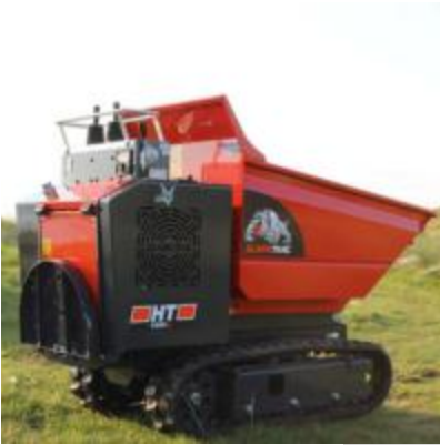
SKIP LOADER/TRACKED IT

CAPACITIES: 1,000KG WIDTH: 750mm ENGINE: 10.4kW