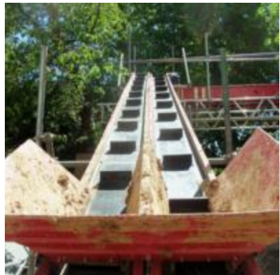
MODULAR CONVEYOR DBL

CAPACITIES: 450KG WIDTH: 750mm ENGINE: 10.4kW