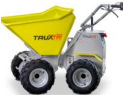
ELECTRIC MINI DUMPER

LENGTH: 2.5M - 13.75M THROUGHPUT: 20T/H ENGINE: 2.2/4.0kW