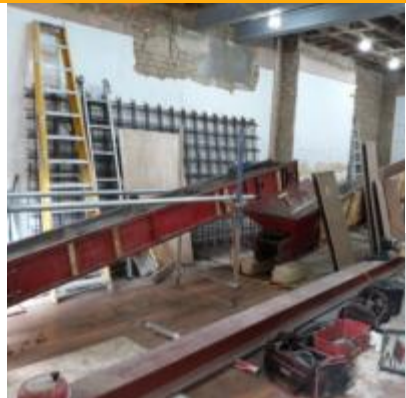
MODULAR CONVEYOR BELT

CAPACITIES: 1,000KG WIDTH: 750mm ENGINE: 10.4kW