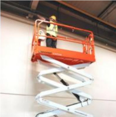
SCISSOR LIFT S3226E 9.9M

WORKING HEIGHT: 7.8M WIDTH: 0.81M LENGTH: 1.78M WEIGHT: 1,438KG