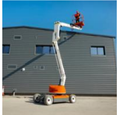
A38 CHERRY PICKER 13.5M

WORKING HEIGHT: 9.9M WIDTH: 0.81M LENGTH: 2.3M WEIGHT: 2,268KG