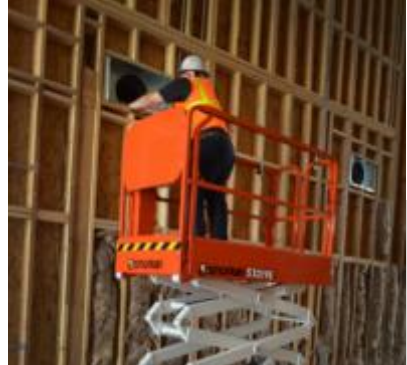
SCISSOR LIFT S3219E 7.8M

WORKING HEIGHT: 5.0M WIDTH: 0.75M LENGTH: 1.2M WEIGHT: 370KG