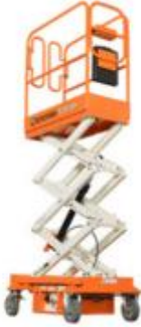
SCISSOR LIFT S3010P 5.0M

WORKING HEIGHT: 5.0M WIDTH: 0.75M LENGTH: 1.2M WEIGHT: 370KG