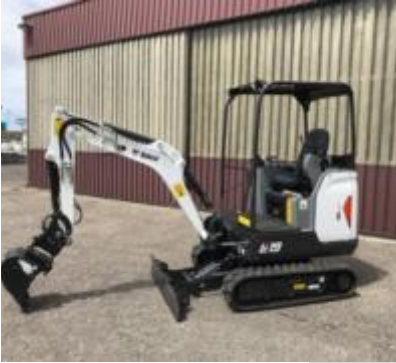
MINI EXCAVATOR 2T

DIGGING DEPTH: 2.4m WIDTH: 980 - 1,350mm ENGINE (STAGE V): 14.6kW